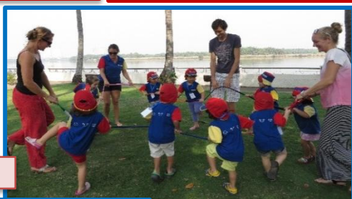
Practising hopping on one leg!