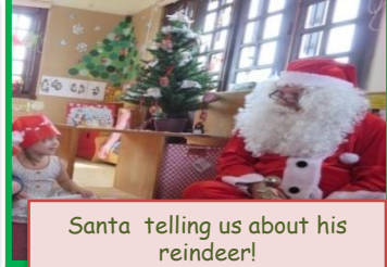
Santa telling us about his reindeer!

Thank you so much for bringing your traditional Christmas dishes !