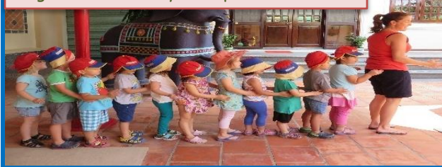
Big kids train ready to depart Choo choo!