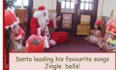
Santa leading his favourite songs Jingle bells!