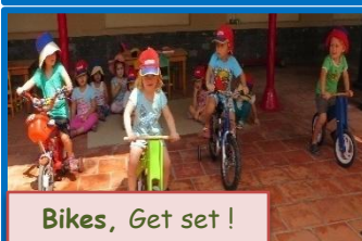
Bikes, Get set !