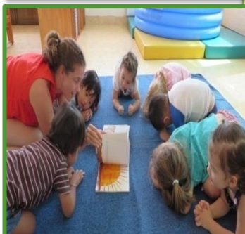
Being tiny eggs on a leaf in the light of the moon!