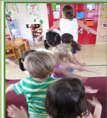
Wiggle your bums! Spread your wings! Let's do the Bee dance!