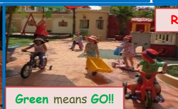
Green means GO!!