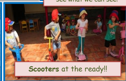
Scooters at the ready!!