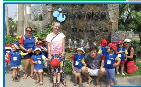
Singing all our transport songs in the shade.