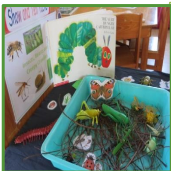
The sticks! ☺