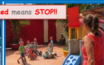
Red means STOP!!